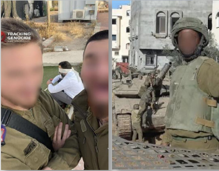
From left to right: Screenshot from Telegram group "Israel Genocide Tracker"; Screenshot from the Hind Rajab Foundation's X account; Screenshot from Telegram group "Israel Genocide Tracker"